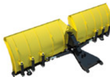
V-Plow Series V-35